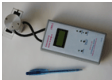
Carbon Dioxide Sensor

Examples of portable sensors (test models) based on LED-PD optopairs developed at IBSG