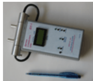
Water in Cut-Oil Sensor