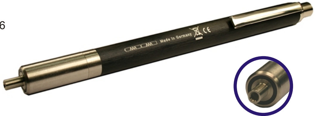
Ferrule 2.5 mm