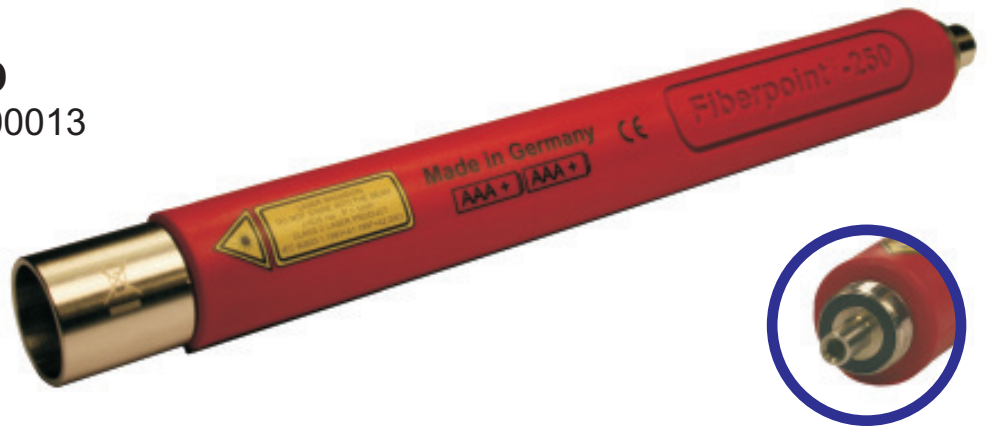
Ferrule 2.5 mm