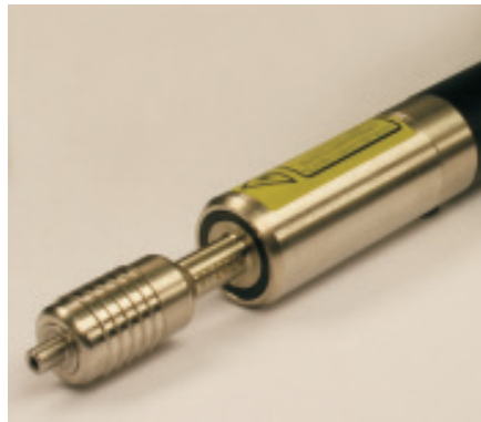
FIBERPOINT® 250MD with Adapter