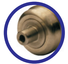
Ferrule 1.25 mm