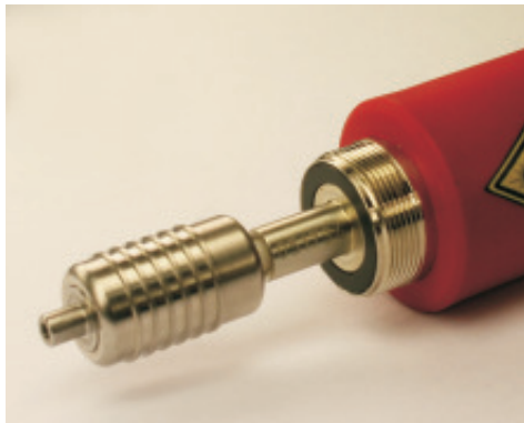
FIBERPOINT® 250 with Adapter