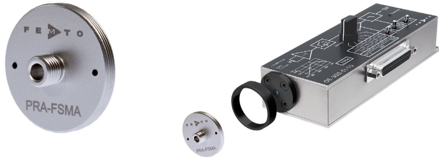
The picture shows fiber-adapter PRA-FSMA with photoreceiver OE-300-SI-10-FST.