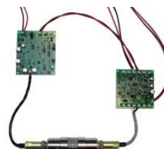
Evaluation system for CO 2 (or CH 4 ) detection