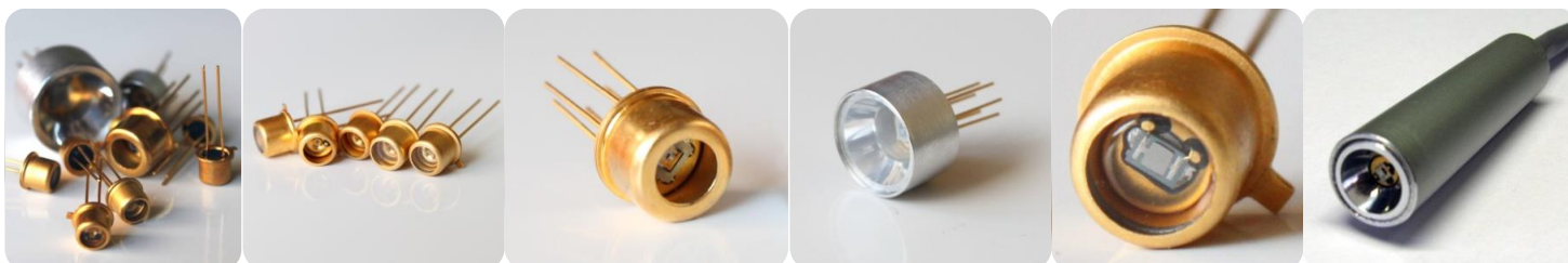
LED & PD chips, LED & PD wafers, LED & PD arrays