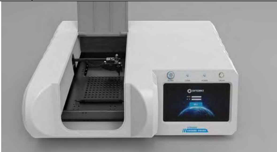
Figure 2 EOC-SI-R8000's Sample Cabinet